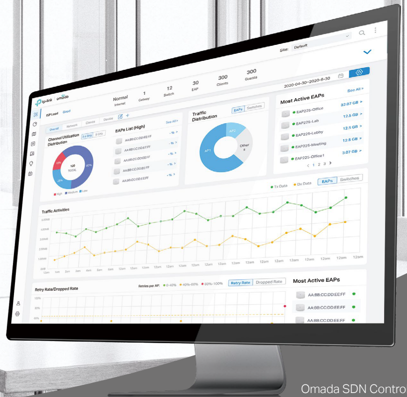
Omada SDN Controller